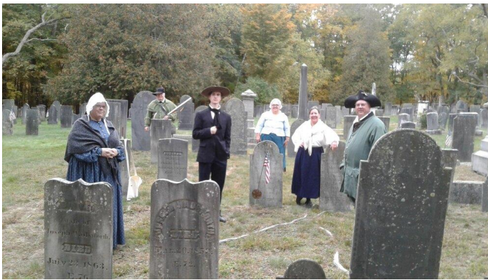
Center Cemetery reenactors