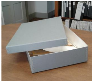
Ephemera stored in one of our acid free boxes

Each box is composed of acid free material which prolongs the life of the item. In addition, within the box fragile items are placed in an acid-free plastic sleeve for protection. At the present time, the Society counts over 250 specifically designated boxes. Each box is labelled on the outside with boxes stored in numerical order. The shelved 'Box Room' at Academy Hall is darkened room to protect the item from light or heat damage.