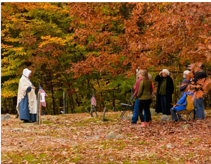
Old Burial Yard tour